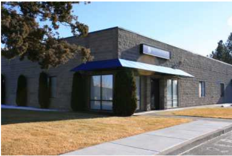
Above—Home of RBD in Bend, OR Below—An RBD Ion Gun