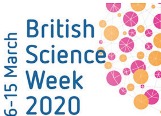
Bexhill Youth Science Fair