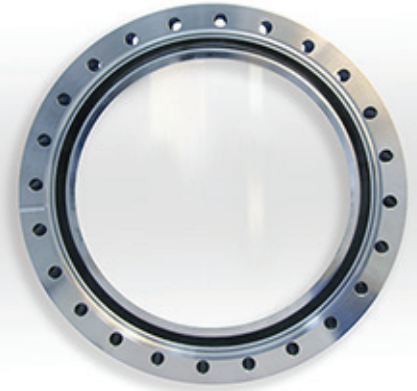
VPZ200Q & VPZ200Q-183